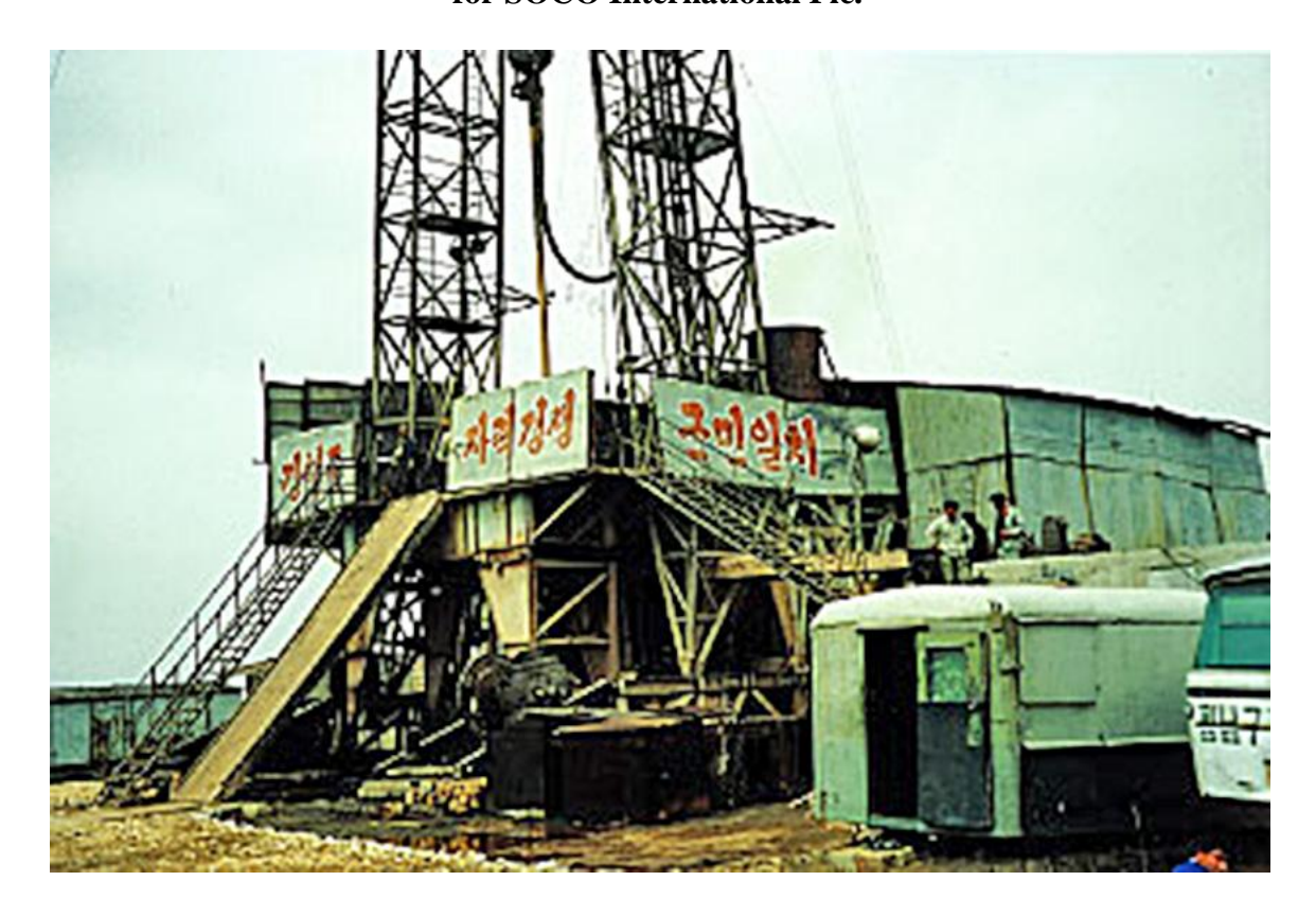
Figure 3. North Korea's Romanian-manufactured drilling rig working on well "No. 401" for SOCO International Plc.