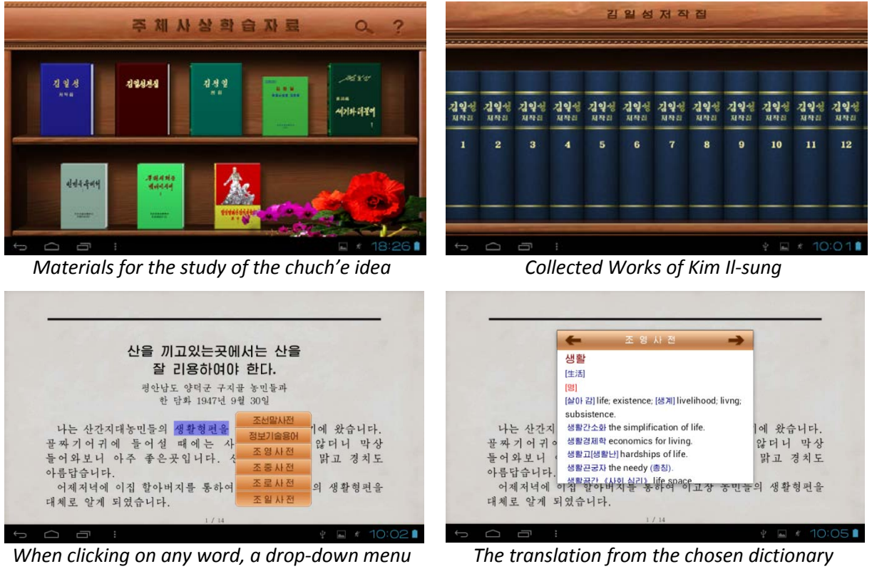
with the avaliable dictionaries appears

need to do is put your finger on any term, wait for a second or two, and a context menu appears, offering a choice of six dictionaries to search in.