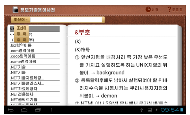
Search terms can be entered in Korean, English or Chinese