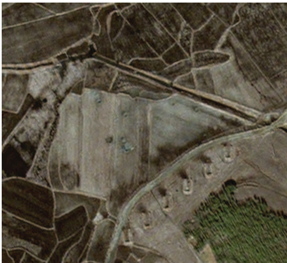
Figure 10. Central Firing Position near Kaun-gol, Showing Impact Craters from ROK Counter-battery Fire, November 29, 2010