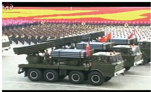
Figure 6 (right). M-1993 122 mm MRL, October 10, 2010 (KCTV)