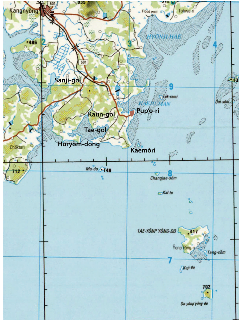
Figure 2. Map of Kangnyöng-bando - Yönp'yöng-do Area

On November 16, 2010 the ROK Joint Chiefs of Staff (JCS) announced that it planned to conduct the annual Hoguk training exercise during November 22-30. As is routine for these exercises, the DPRK