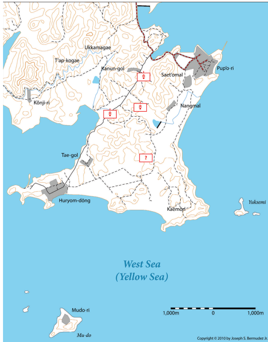
Figure 3. Map of Deployment, (Joseph S. Bermudez Jr.)

“U” shaped revetted positions. 13 Adjacent to the individual positions was a small crew dugout (although these were not completed in many of the satellite images available). Given the dimensions of the prepared firing positions and the size of the vehicles themselves, it would appear that the battalion was equipped with the M-1985, M-1992 or M-1993 multiple rocket launcher (MRL). 14