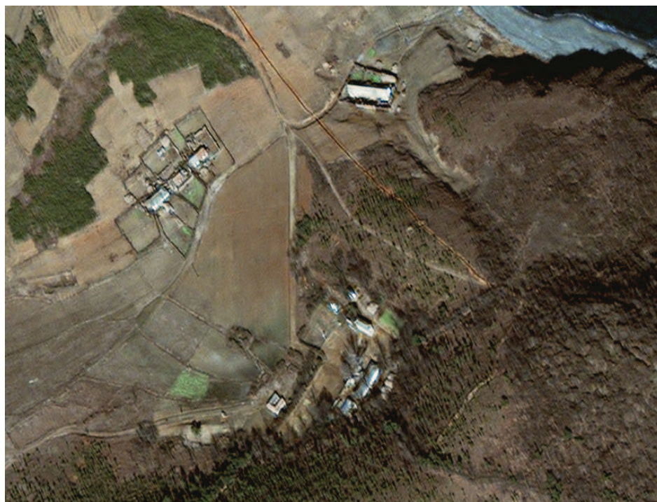
Figure 9. Communications Cable Trench, November 29, 2010

structure and terrain. Interestingly the northern MRL battery position, 460 m southeast of Kaun-gol, straddles the trench. That these measures were effective was confirmed by the NIS. Director Won Sei-hoon stated that “it was difficult to intercept further North Korean military communication before and on the day of attack because the North used landlines rather than wireless communication to carry out operations.” 37