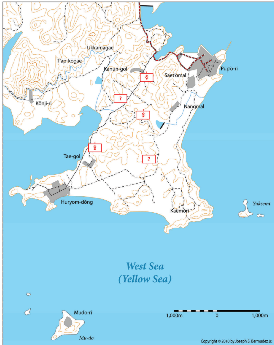
Figure 7. Map of Deployment, (Joseph S. Bermudez Jr.)

On November 26, three days after the attack, KPA artillery units deployed on Kangnyŏng-bando, likely